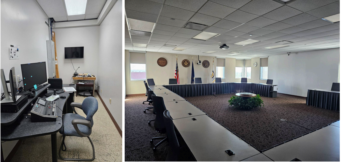
PICTURED ABOVE: 5 th Floor Committee Room Production Booth (Left) and Committee Room (Right)