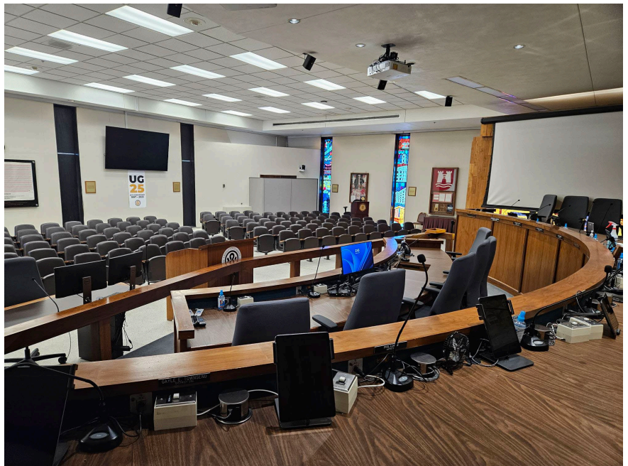
PICTURED ABOVE: Commission Chambers Production Booth (Left) and Commission Chambers (Right)